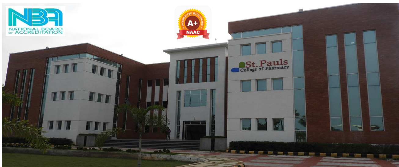
ST. PAULS COLLEGE OF PHARMACY, TURKAYAMJAL RANGA REDDY, HYDERABAD, TELANGANA