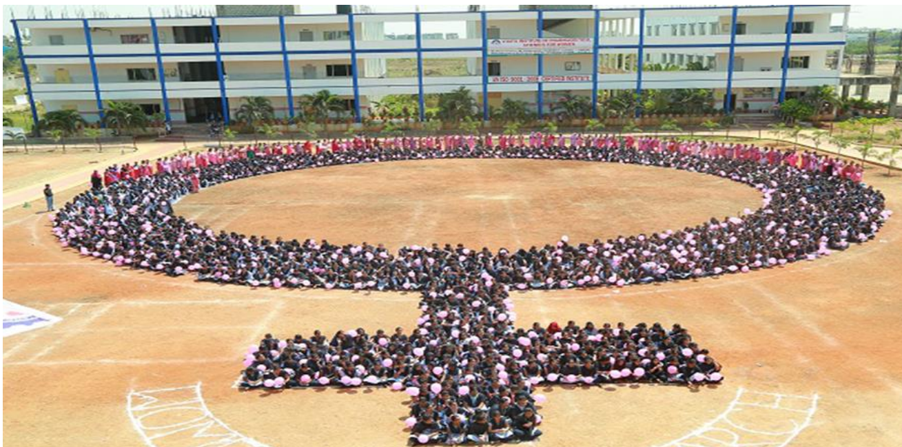
VIJAYA INSTITUTE OF PHARMACEUTICAL SCIENCES FOR WOMEN VIJAYAWADA, KRISHNA, ANDHRA PRADESH