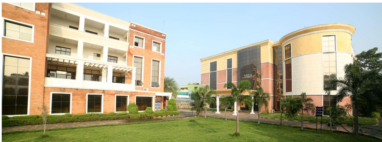
VELS INSTITUTE OF SCIENCE, TECHNOLOGY AND ADVANCED STUDIES (VISTAS) PALLAVARAM, CHENNAI, TAMIL NADU